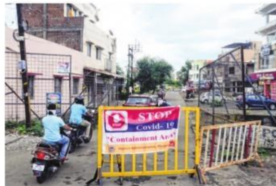
People make way through containment area in Awadhपुरi